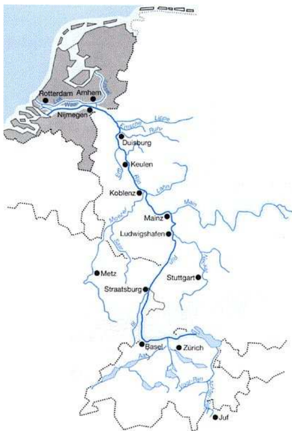
Fig. 1: Rhine basin