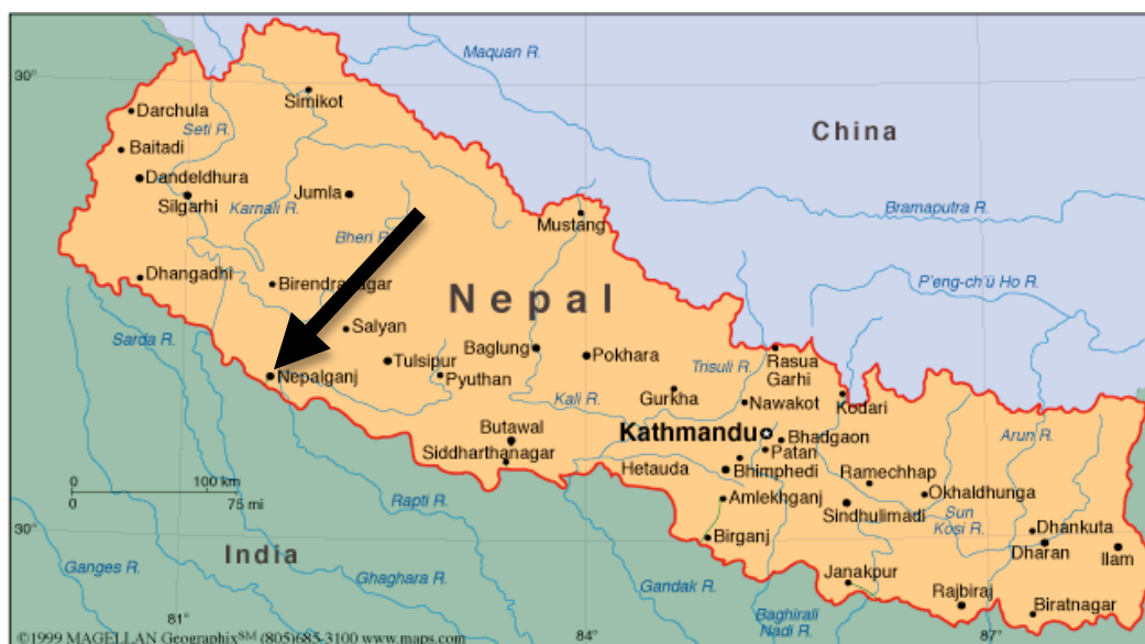
Figure 2 - Nepalganj (with arrow), Nepal